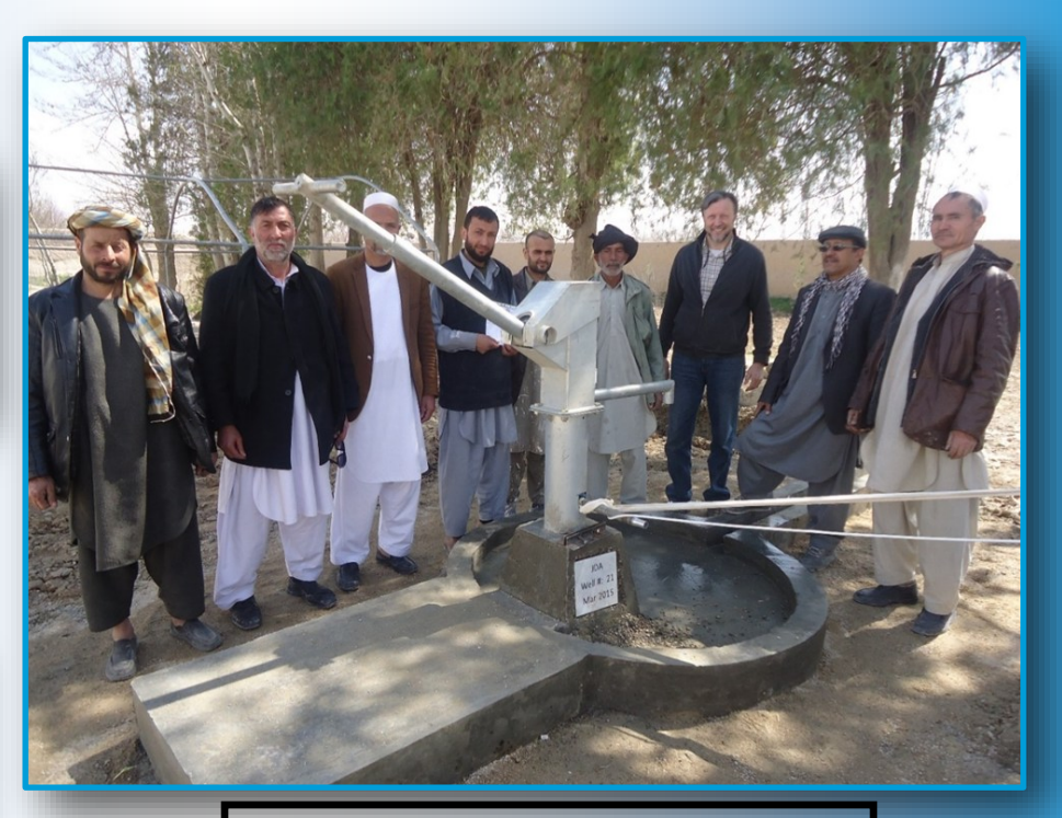
Well drilling and hand pump repair trainees stand by new well in Shaqeq Balkhi School

The well was successfully completed and school administration and teachers were very appreciative and contempt. By drilling this well, more than 2,400 students have gained access to safe water and the opportunity for improved health.