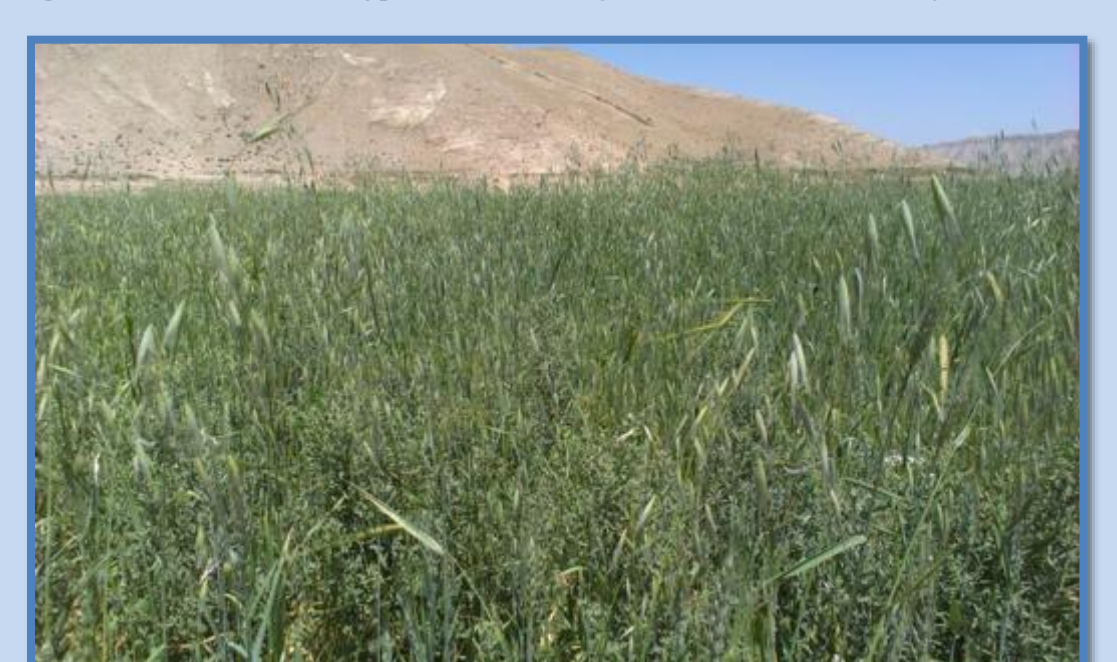
Figure 2: Weed burden in a typical wheat field. (It is hard to find the wheat.)

Weed control methods implemented over time have cumulative beneficial effects as the weed burden in the soil seed bank can be reduced. An integrated approaches are preferable, reducing reliance on the market as well as the human and agro-ecological risks associated with herbicides.