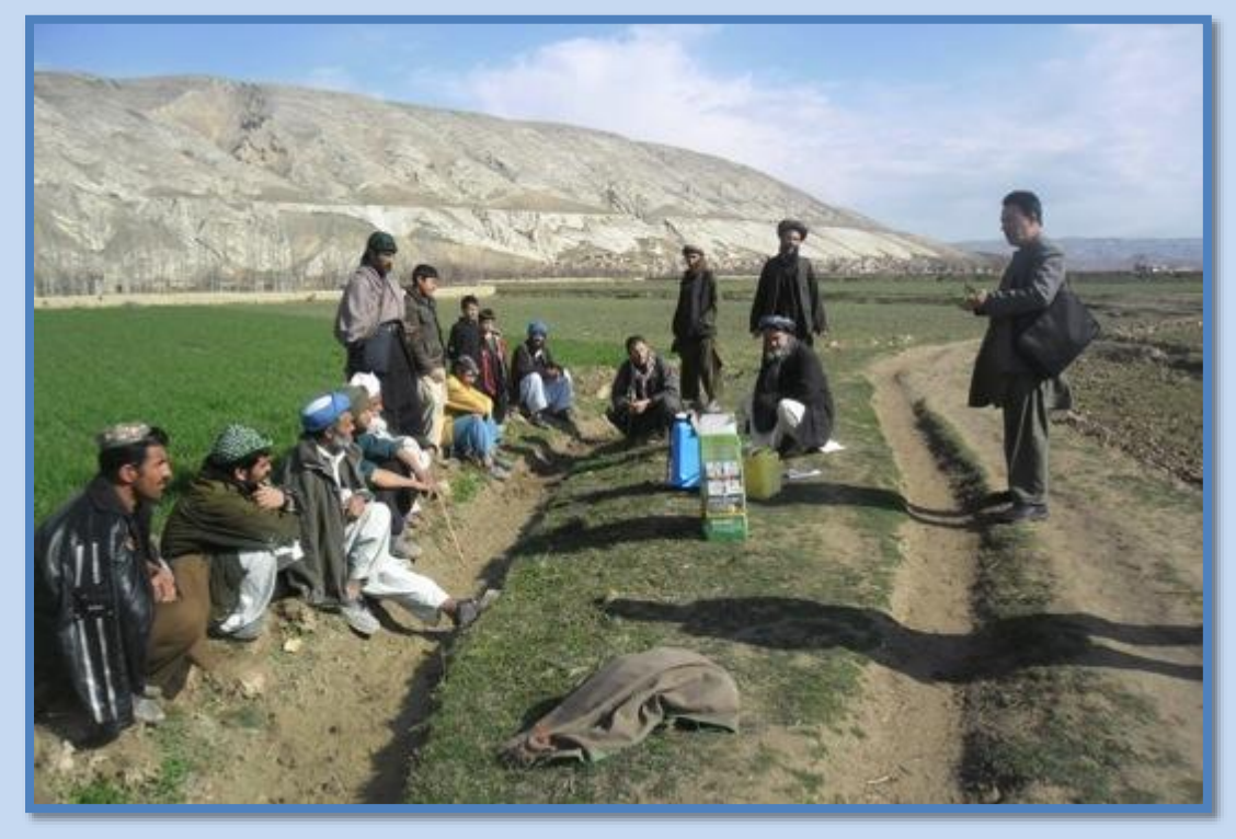
Figure 3: JDA trainer delivering specialized weed control training in Saripul, Suzma Qala 2013

2009/10 4 provinces, 19 districts, 1702 farmers 2010/11 5 provinces, 29 districts, 3127 farmers 2011/12 5 provinces, 29 districts, 2680 farmers 2012/13 5 provinces, 18 districts, 606 farmers