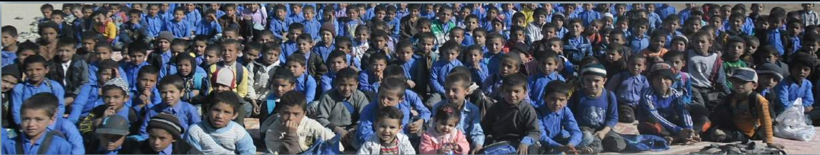
Providing children with the knowledge and skills of proper hygiene and hand washing will give them the capacity to protect themselves from sickness.