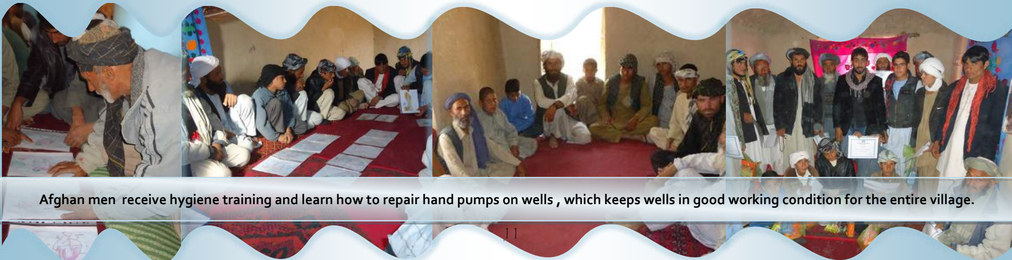
Afghan men receive hygiene training and learn how to repair hand pumps on wells, which keeps wells in good working condition for the entire village.

"We did not know about worms and germs. We are happy about the information we have received in this course and are thankful for this kind of program for the women. We hope the program continues to expand and help us have healthy children, families, and communities."