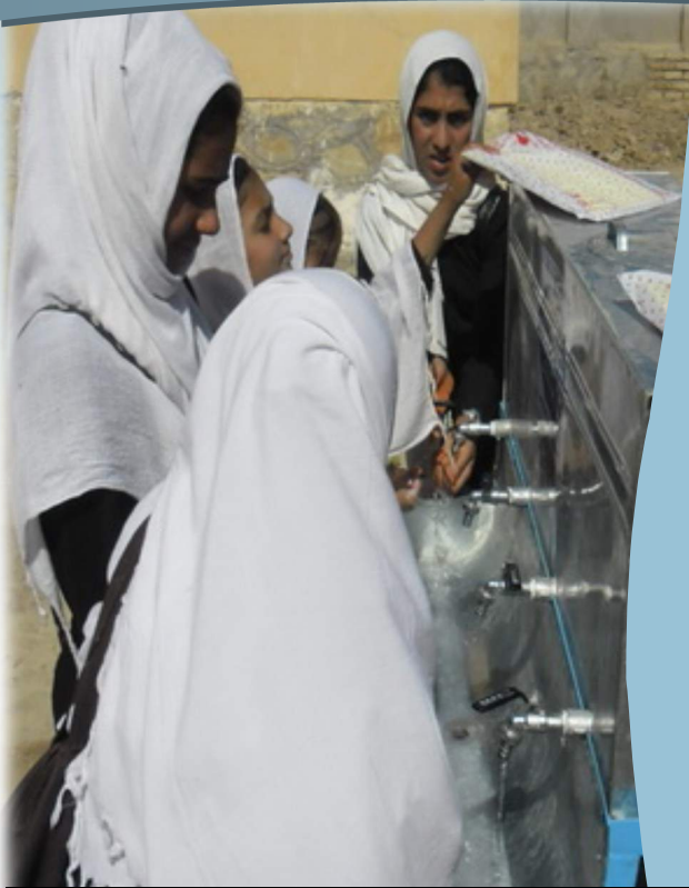
Students immediately started washing their hands with soap after they received the hygiene messages from the puppet show.

Many Afghan communities do not have an information network to disseminate basic awareness about health and hygiene, even more, they lack appropriate health centers. In our ongoing efforts to promote the importance of hygiene and handwashing, a puppetry program in schools was initiated. The goal of this program is to make children aware of the importance of personal hygiene and how it affects their daily lives through a fun and interactive way. This program educates students on hand washing, diarrhea, and the use of safe water. Students also learned about proper hand washing methods and how it is the most effective way to prevent diarrheal and respiratory infections.